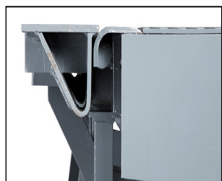
Constant Radius Rear Hinge