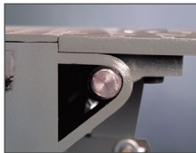
Two-point crown control