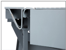
Constant radius rear hinge