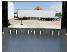
Rugged Steel Safe-T-Lip